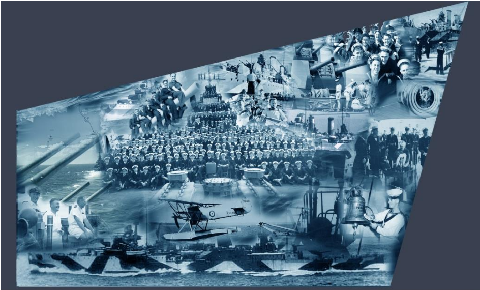
Proposed Memorial to HMAS Perth (1) - Navy League of Australia - Western Australia Division Riverside Road East Fremantle WA Glass Memorial Artwork - Left Side